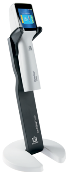
Support stand with HandyStep® touch

Repetitive pipette, includes universal AC adapter (for USA, Europe, UK, Japan, Australia and New Zealand), shelf/rack mount, sample PD-Tip™ II, operating manual and performance certificate.