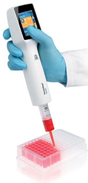
Multi dispensing with the HandyStep® touch and PD-Tip™ //