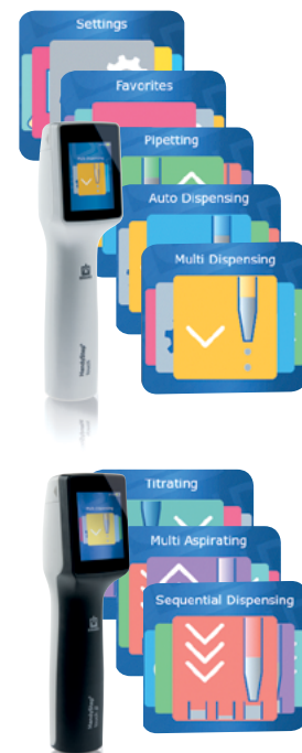
Expanded functionality on the HandyStep® touch S:

The clearly structured menus make fast work with intuitive operation possible, while the most important functions and parameters are always in view.