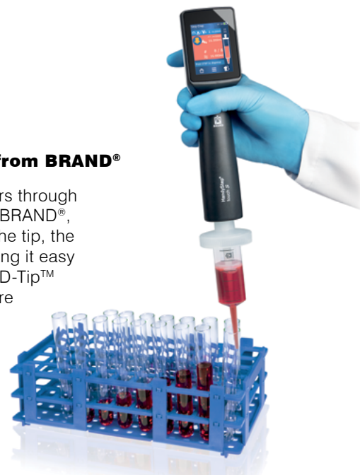
Sequential dispensing with the HandyStep® touch S and PD-Tip™ //

The HandyStep® touch saves time and prevents errors through automatic tip size recognition of the PD-Tip™ // from BRAND®, with patented coding on the pistons. After inserting the tip, the size is automatically recognized and displayed, making it easy to select the volume to be dispensed. When a new PD-Tip™ of the same size is inserted, all instrument settings are maintained.